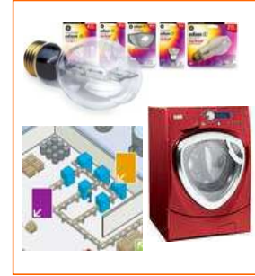
GE Home & Business Solutions